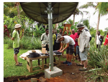
A team installs a refurbished satellite dish transported across the country to bring a faster internet connection to the Zook's.