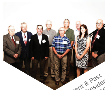
Current & Past Board Presidents in attendance