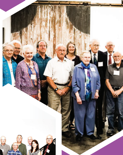
Members since 1969